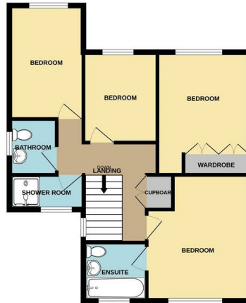
1ST FLOOR 633 sq.ft. (58.8 sq.m.) approx.